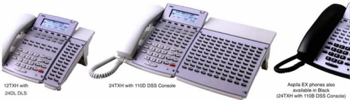
12TXH with 24DL DLS